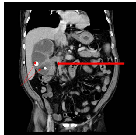
[Table/Fig-1]: Axial CT scan image of arterial phase shows enhancing irregular thickening of wall of pelvicalyceal system of right kidney (↑) [Table/Fig-2]: Axial CT scan image of venous phase shows enhancing irregular thickening of wall of pelvicalyceal system (↑) and renal pelvis of right kidney with calculus (↑) in renal pelvis [Table/Fig-3]: Coronal CT scan image of venous phase show enhancing irregular thickening of wall of pelvicalyceal system, renal pelvis, upper ureter (↑) on right side with calculi (↑)